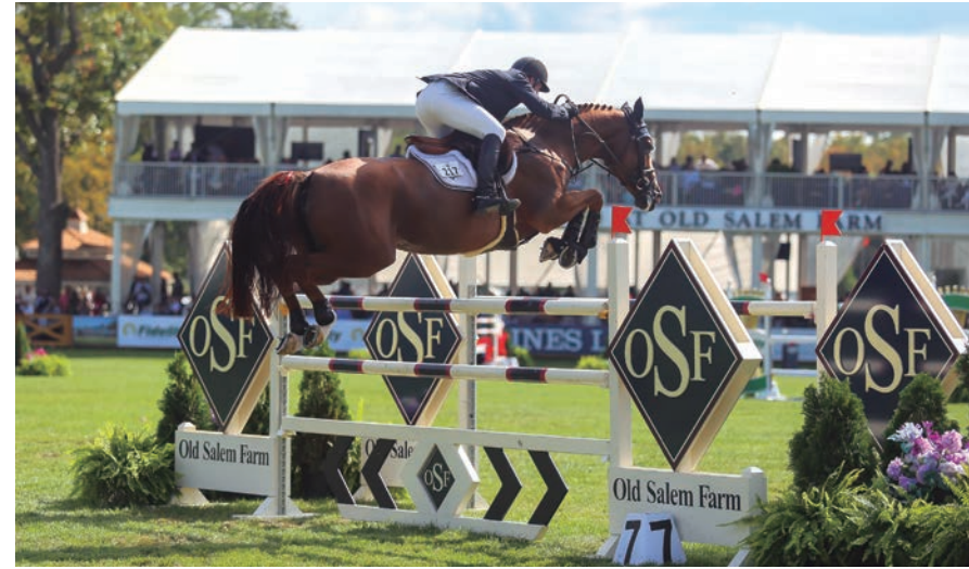
OLYMPIC TEAM GOLD MEDALIST MCLAIN WARD COMPETING AT OLD SALEM FARM

For more information, please visit www.oldsalemfarm.net